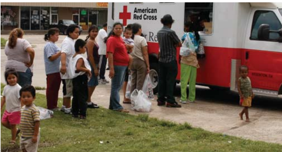
Individuals and families line up before a Red Cross emergency response vehicle for meals and bottled water in Wallisville, Texas, after Hurricane Ike knocked out power to their neighborhood.

On June 1, the Red Cross marked the beginning of hurricane season 2008. It proved to be one of the most destructive and costliest hurricane seasons in U.S. history.