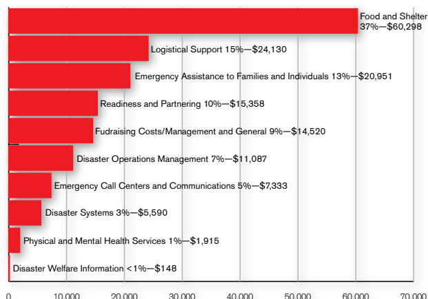
Expenses (in thousands)

Note: All figures, although accurate, are unaudited.