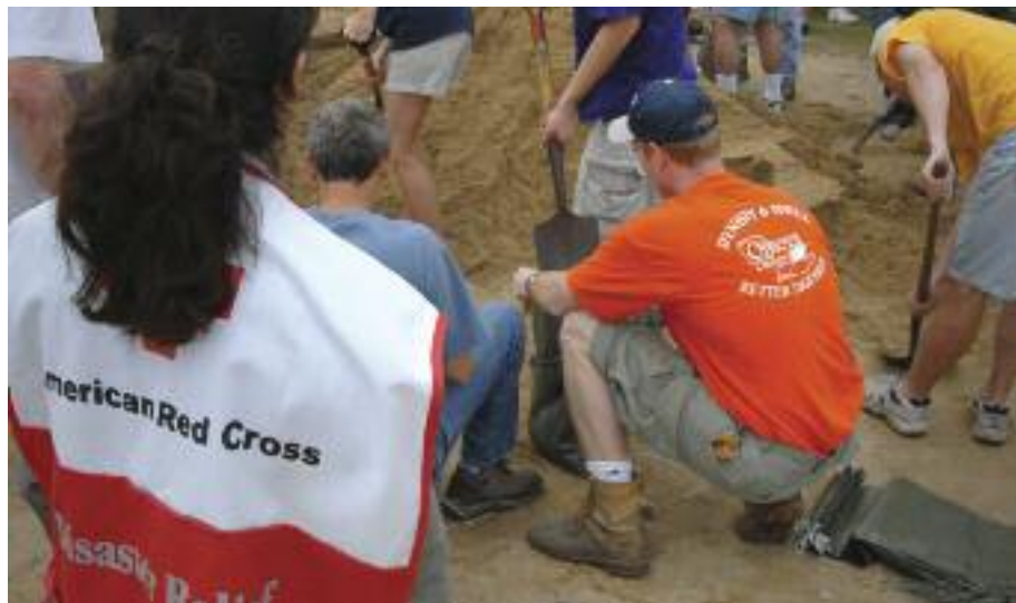
The Red Cross distributed meals and snacks at sand-bagging sites—like this one in Cedar Rapids, Iowa—throughout states affected by flooding.