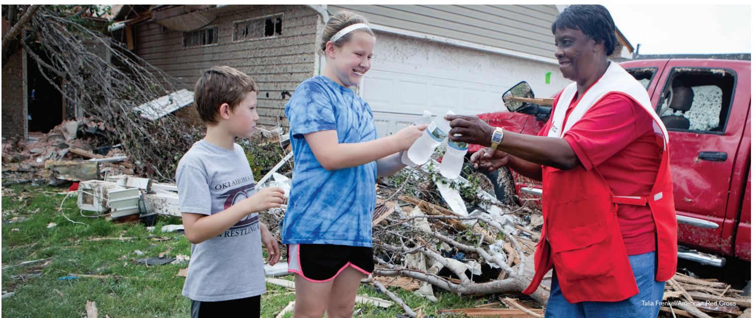
An American Red Cross volunteer delivers water to children in Moore, Okla.

Case managers already have identified 2,500 potential long-term cases and are working with those people to determine what they need and to offer assistance. In early November, the call center in Moore was receiving about 60 calls per day from people needing help.