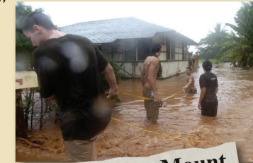
Damage Estimates Mount From Flooding

...the Red Cross was in the Laie community, going door to door to help families, asking what they could do to help. The Red Cross workers helped put furniture up, told people where to go for shelter (BYU), Red Cross was already operating the shelter. My family could not go back to their home and was the first family at BYU shelter. There were cots, blankets, a place to eat, food, canned goods. The Red Cross was "Johnny on the spot." I am very appreciative of what the Red Cross does. The Red Cross was really organized, well prepared, knew what they were doing. The Red Cross trained people in the community throughout the year. When emergency did occur, they were there.