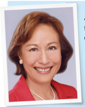
A message from the CEO