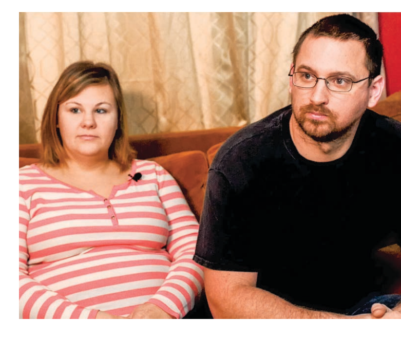
"It was very comforting knowing they were there," says Channing. "Them just being there was amazing, and I'm very thankful."

In addition to ensuring that Channing's needs were met following the fire, the Red Cross reached out to