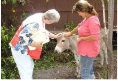
Adorable Kona donkey survivor