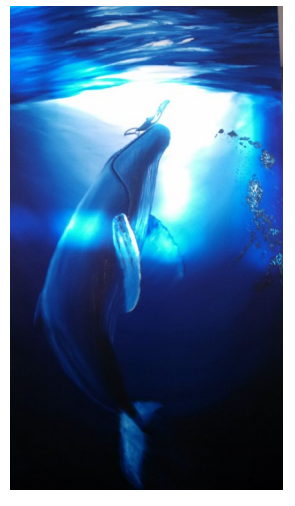
Bid on a Wyland painting!