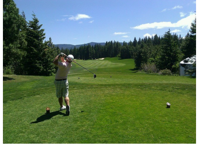
Bid on golf packages!

To our wonderful Volunteers and Supporters,