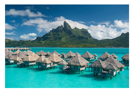
Bid on a Bora Bora hotel stay