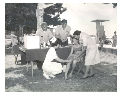
First Aid Stations then ... ... and now