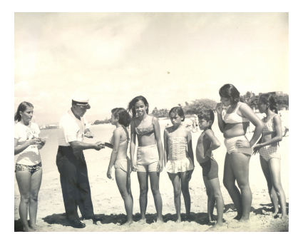
Free Summer Swim 45 years ago