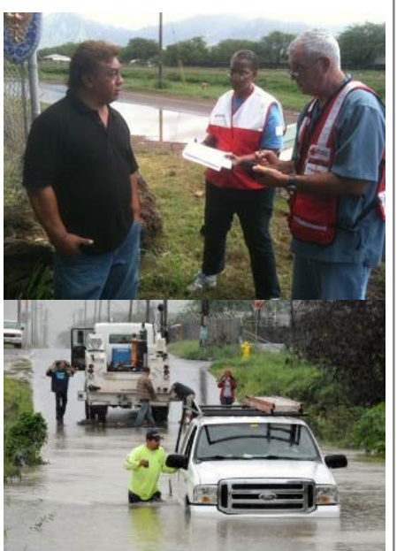
Flooding prompts opening of Red Cross shelters on Oahu & Maui

Red Cross volunteers distribute disaster relief items on Oahu and Maui