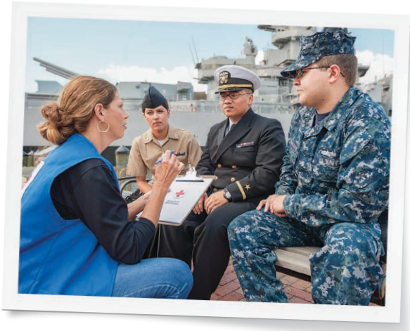
VA and the Red Cross help veterans get the employment they deserve.

Through VA Learning Hubs, transitioning service members and veterans can take advantage of both online and inperson study. Each week, online course modules are