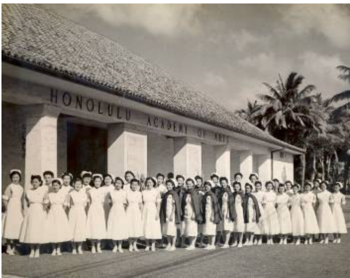
1942-45: Red Cross uses part of the Academy of Arts building at 900 South Beretania Street