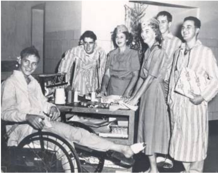
Nurse Aides with soldiers (c. WWII) Nurse aides help soldiers at Tripler Hospital celebrate Christmas.