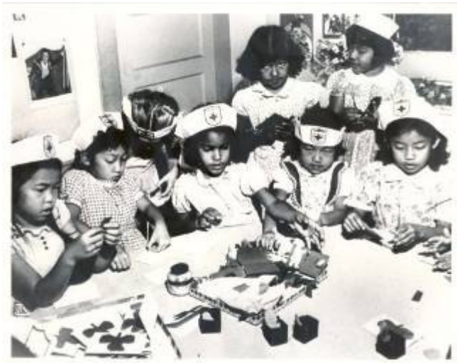
1945-47: Junior Red Crossers