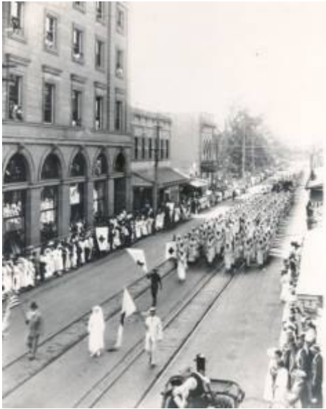
Parade on King Street, May 1918 Second War Fund Drive held, netted $415,000. Included spectacular parade of some 2,000 women workers. The drive raised $677,265.