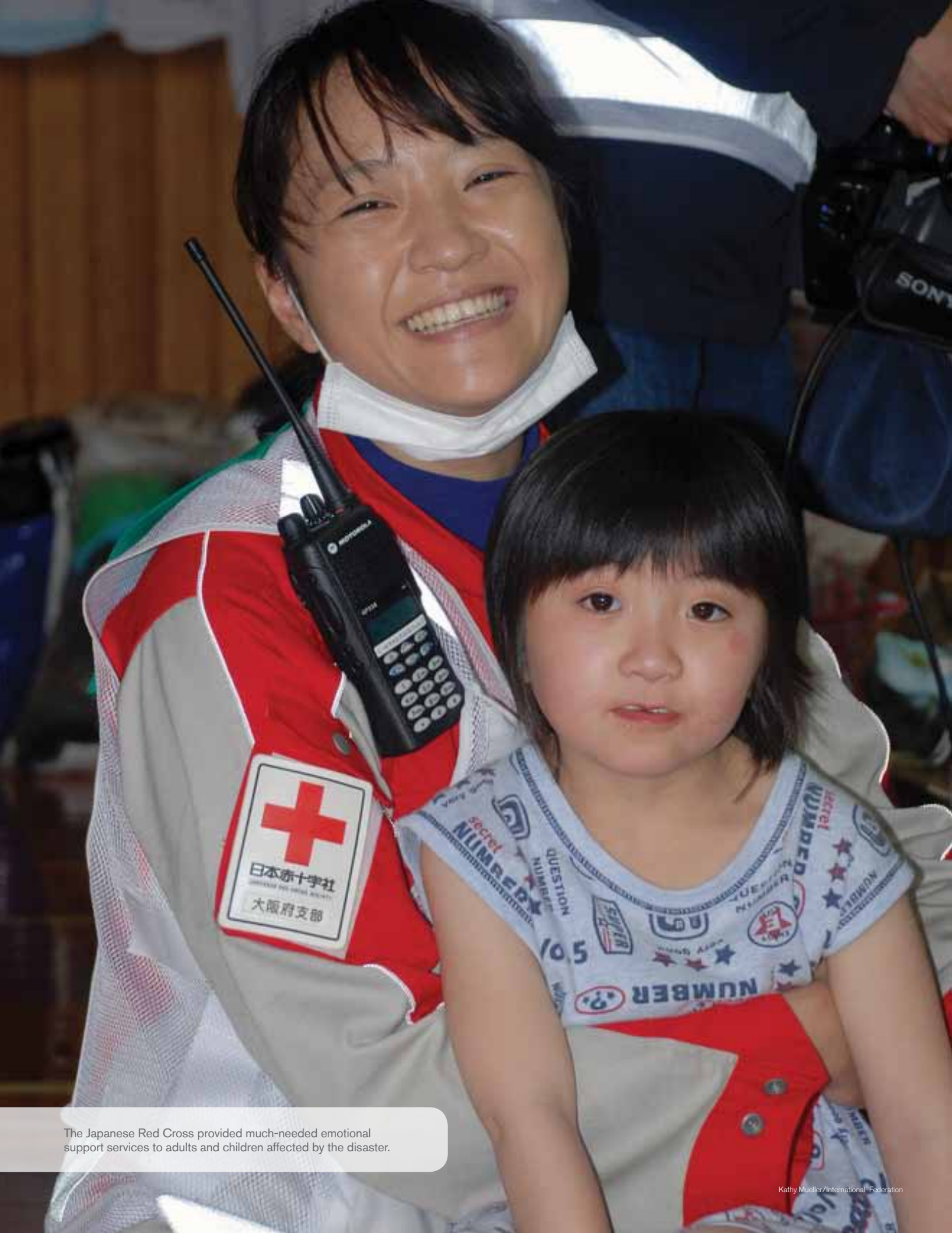
The Japanese Red Cross provided much-needed emotional support services to adults and children affected by the disaster.