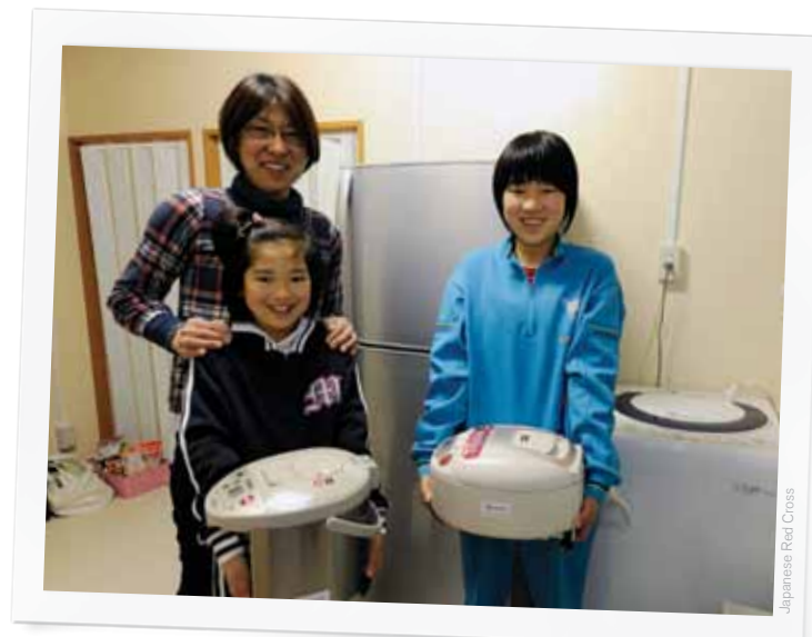
A family in their new temporary home with appliances provided in part by funding from the American Red Cross.

Due to the generous support of donors, the American Red Cross raised $312 million for Japan relief and recovery and, one year later, virtually all the funds have been spent. More than 90 percent of the money has gone to the Japanese Red Cross to improve living conditions for families who lost their homes and to rebuild needed hospitals and a nursing school. The remainder of the money has been used to cover costs the American Red Cross incurred assisting U.S. military family evacuations from Japan, U.S.-based preparedness efforts associated with the tsunami, as well as general operating costs of the American Red Cross.