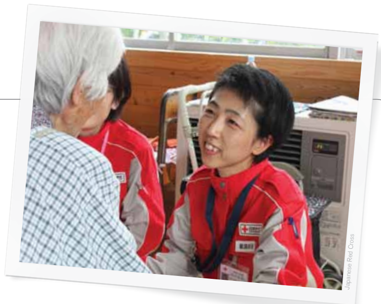
Japanese Red Cross

Today, donations to the American Red Cross are supporting the Japanese Red Cross in rebuilding the nursing school, which will be dedicated to training specialists in disaster medical care.