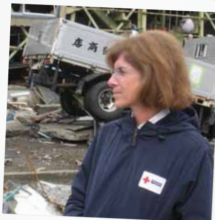
Gail McGovern President and CEO

A handwritten signature in black ink that reads "Gail McGovern".