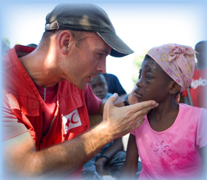
An American Red Cross relief worker administers first aid to a Haitian girl injured during the 2010 earthquake.

With more than 13 million volunteers, we use our presence in nearly every community to provide urgent humanitarian assistance to the world's hardest-to-reach and most vulnerable populations.