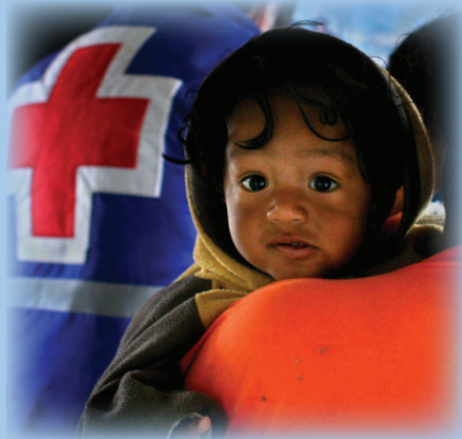
A Red Cross mobile medic unit in Peru attends to urgent needs.

With more than 97 million volunteers, members, and staff, we use our presence in nearly every community to provide urgent humanitarian assistance to the world's hardest-to-reach and most vulnerable populations.