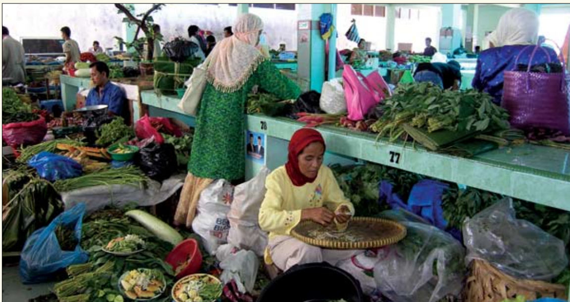
Food markets, like this one in Aceh, are being built with the support of the American Red Cross and Community, Habitat and Finance International.

Local markets have long been community focal points throughout Aceh province, serving as centers of small-scale economic activity. In partnership with the organization Community, Habitat and Finance International, the American Red Cross is assisting in the revitalization of small businesses in Aceh. This project, expected to benefit approximately 103,000 vendors and buyers, is rehabilitating and rebuilding market stalls in 16 communities and distributing 900 grants to small businesses and local entrepreneurs.