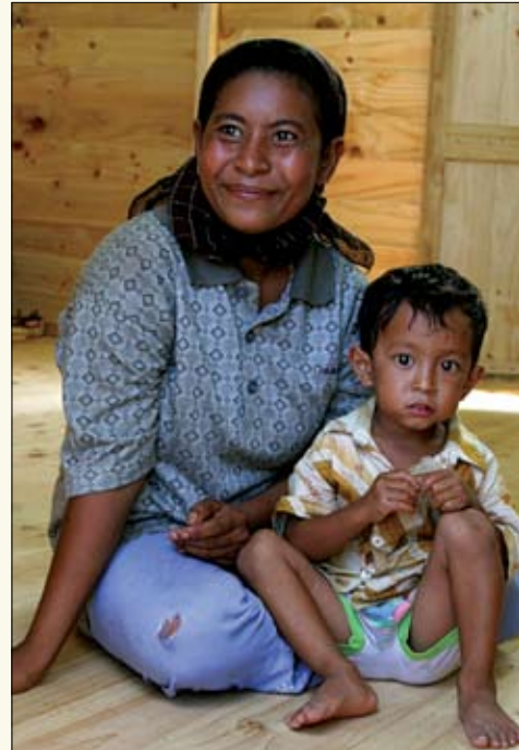
An Indonesian mother and child sit in their new transitional shelter.