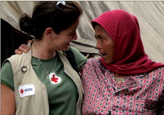
An American Red Cross worker provides comfort to an Indonesian woman.

The revised strategy continues to maximize community participation with American Red Cross efforts at all stages of program planning and implementation. This approach guarantees accountability to beneficiaries and fosters good stewardship of donated funds. Similarly, regular sharing of information with partners and donors helps to ensure that the American Red Cross is better equipped to continue meeting survivors' needs, while spending donated funds efficiently and effectively.