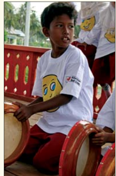
Making music is one way psychosocial programs help children heal.