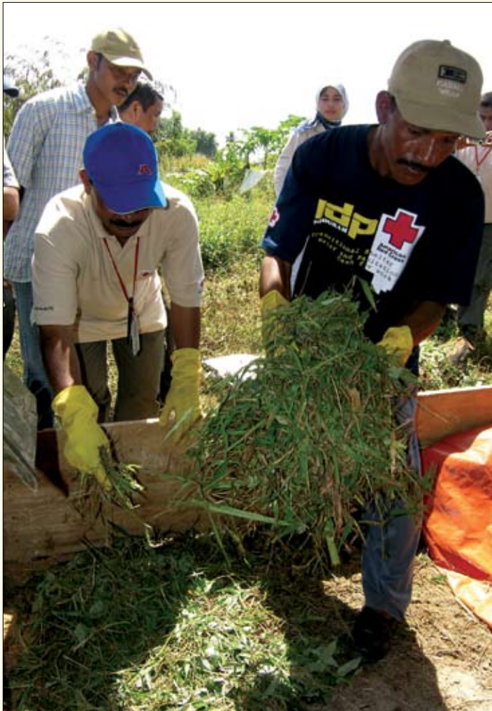
Villagers in Calang, Indonesia, learn how to make and use environmentally-sound compost.