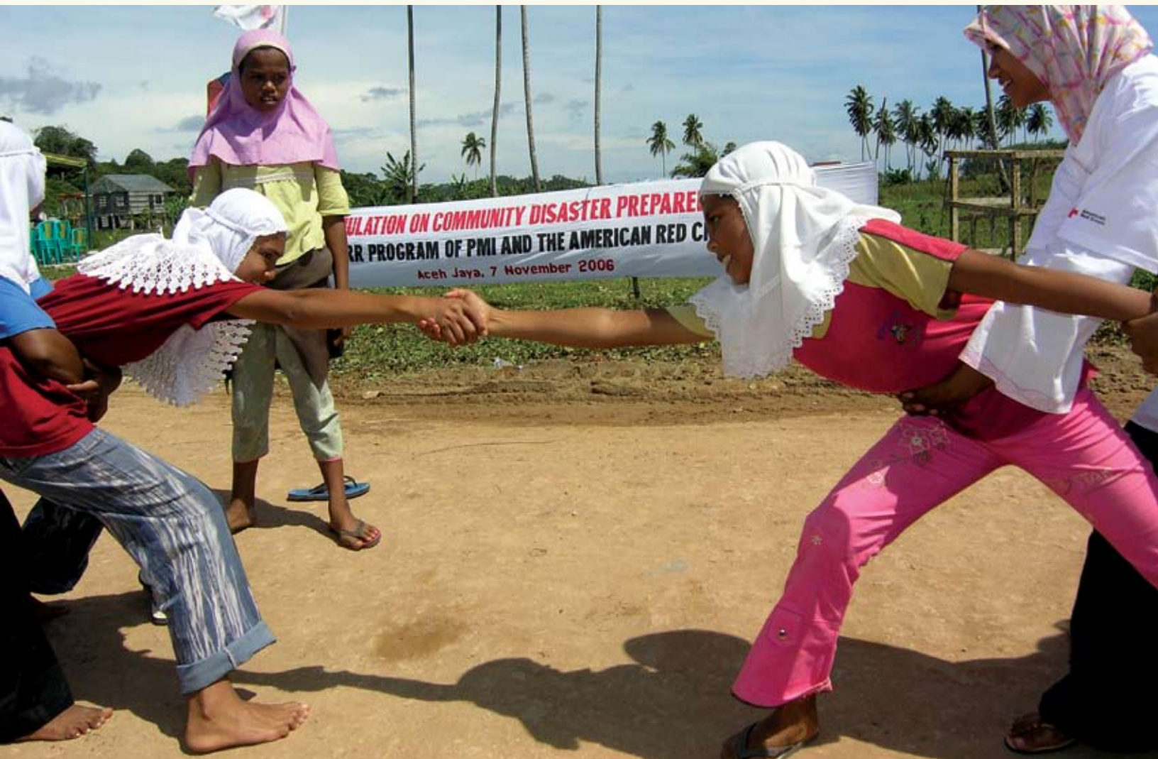
Girls practice lifesaving techniques that could help prevent the loss of life in future disasters.