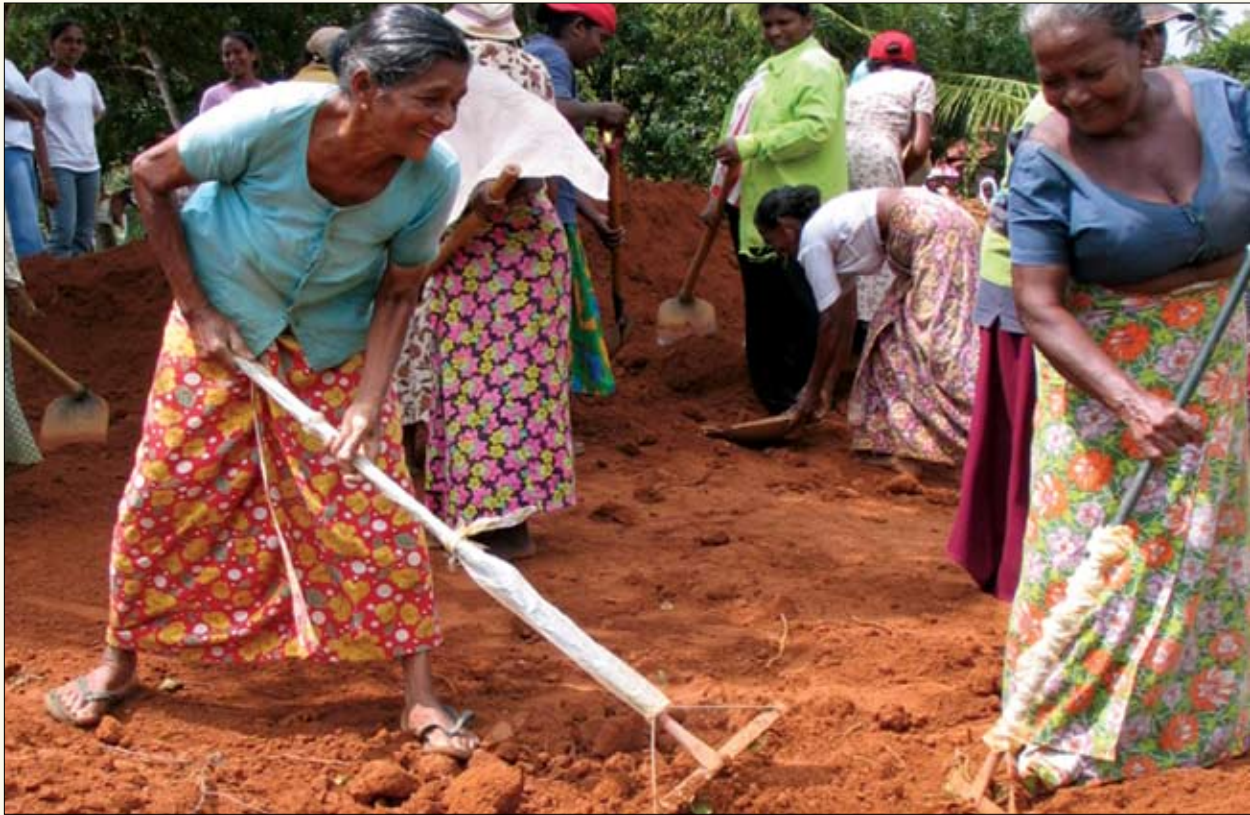
Women working on an American Red Cross cash for work project in Matara, Sri Lanka.