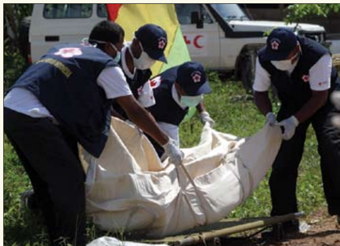
Indonesian Red Cross workers participate in a disaster drill.

Considering that several countries affected by the tsunami are located in some of the most disaster-prone areas of the world, disaster preparedness is critical to the health and safety of the region's populations. To help communities better prepare for future emergencies, the American Red Cross is implementing programs to help raise public awareness of hazards and vulnerabilities and to train communities on how to respond to potential disasters. In Indonesia, a community-based disaster preparedness program is being conducted in 150 Aceh communities. The program includes training local leaders and volunteers through disaster drills, forming rapid response volunteer teams and creating disaster plans for their communities. The American Red Cross and Indonesian Red Cross