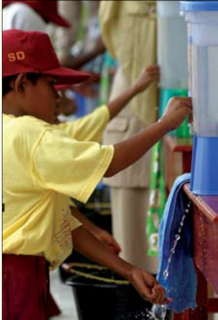
American Red Cross programs teach healthy hygiene behaviors such as washing hands before eating.

these systems. Village committees are working with the American Red Cross and local Red Cross and Red Crescent staff to ensure long-term, local-level participation in the construction and maintenance of these systems. In addition, hygiene promotion programs complement these projects to reinforce the importance of healthy hygiene practices, such as hand washing and how to safely store water, which greatly reduce the risk of disease. To date, American Red Cross water and sanitation programs have restored access to clean water and proper sanitation for nearly 9,400 people and more than 3,500 homes and schools in Indonesia, Sri Lanka, the Maldives and Thailand.