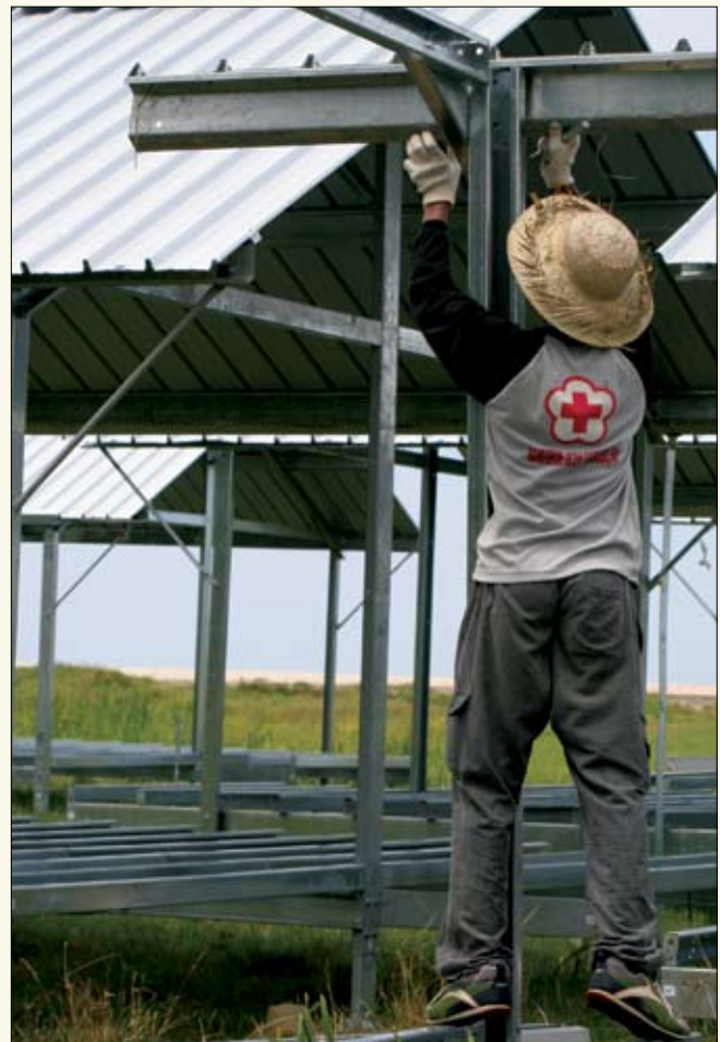
An Indonesian Red Cross worker constructs a steel-framed, transitional shelter.

Furthermore, the American Red Cross is funding housing efforts in Indonesia and Sri Lanka through its partnership with the International Organization for Migration (IOM). The construction of more than 1,800 transitional and permanent shelters, including community buildings, will assist approximately 11,000 internally displaced persons in Aceh province.