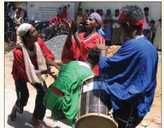
Sri Lankan students perform a hygiene promotion drama to inform the community of how they can help prevent the spread of disease.