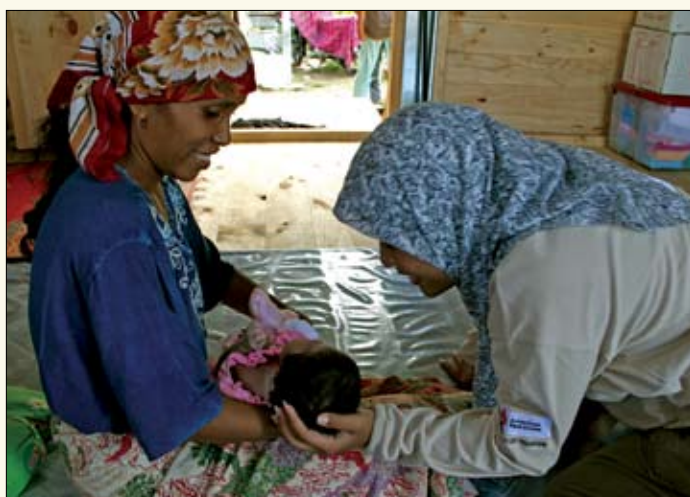
A Red Cross worker in Indonesia visits a mother and her baby for a health checkup.

As part of the “Malaria Free Aceh” campaign in Aceh, Indonesia, the American Red Cross is working to help avert an outbreak of malaria. Insecticide-treated bed nets have proven to be one of the most effective methods of malaria prevention. In addition, the initiative is supporting school-based malaria awareness activities that teach students about the importance of using bed nets. Initial results indicate a 73 percent decline in infection rates in areas where bed net distributions and education activities have taken place.