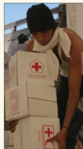
A Red Cross worker unloads relief supplies.

The remainder of this report describes some of the American Red Cross long-term programs underway or planned for the coming years to assist survivors and their communities. For additional information and updates on activities, please visit www.redcross.org/tsunami .