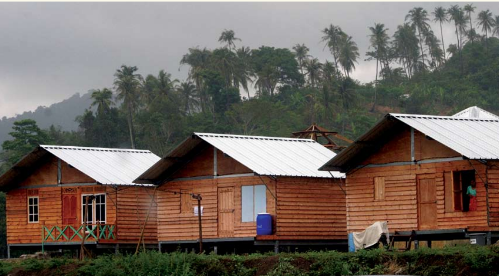
Families in Pulo Weh, Indonesia, live in these transitional shelters.

WWF also wrote “Green Reconstruction Policy Guidelines” as a road map to recovery and a guide for managing the consequences of natural disasters shortly after the tsunami. The American Red Cross uses this guide to plan, carry out and evaluate its recovery projects. Through this approach, the American Red Cross and WWF aim to ensure a long-lasting recovery that protects the environment and strengthens communities for years to come.