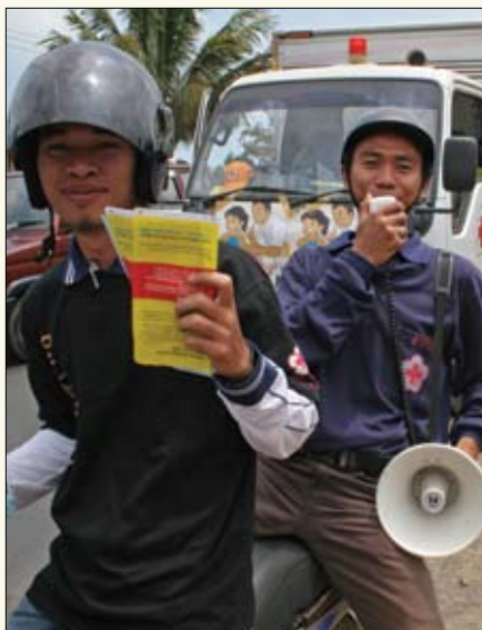
Indonesian Red Cross workers spread the word about an upcoming measles campaign.