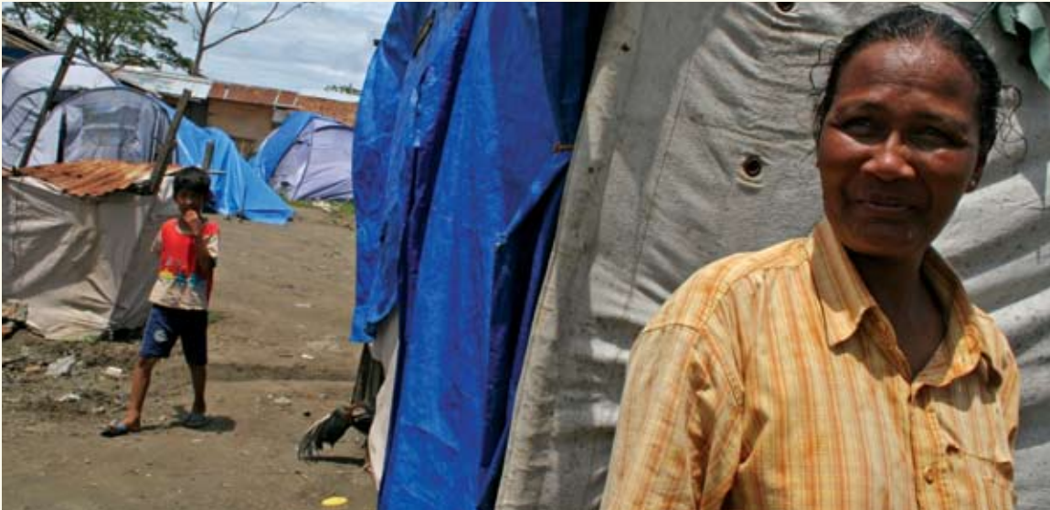
Many people in Indonesia still need critical assistance.

The tsunami affected the environment in many ways as well. Mangrove forests that kept coastal ecosystems in balance and protected much of the coastline from cyclones and storms were destroyed. Construction needs strain forest resources. Fisheries, an important industry in all tsunami-affected areas, must be managed to avoid depletion of resources. In all its programs, the American Red Cross works to protect the environment, provide sustainable livelihoods options and build a brighter future for all.