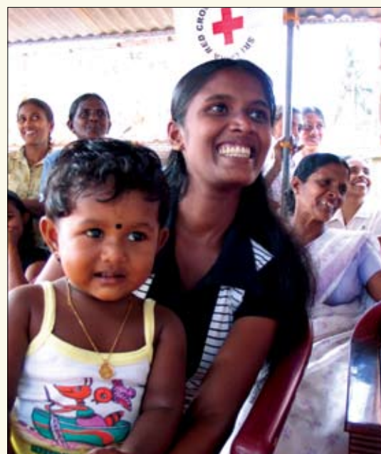
A Sri Lankan woman and child watch a psychosocial support program.

The American Red Cross, working through the ICRC in Sri Lanka, is assisting the SLRCS to strengthen its capacity to provide such tracing services. Through this effort, SLRCS volunteers from every district across the country receive basic training to handle tracing requests and restore family links for those separated by disaster, migration or conflict. In the current conflict situation in the country’s north and east, SLRCS volunteers are using their new skills to help conflict-affected families exchange urgent family news.