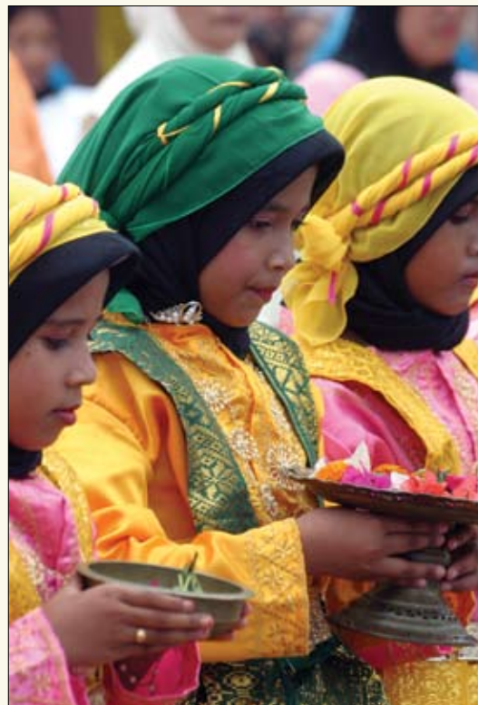
Girls participate in a traditional ceremony in Aceh, Indonesia.