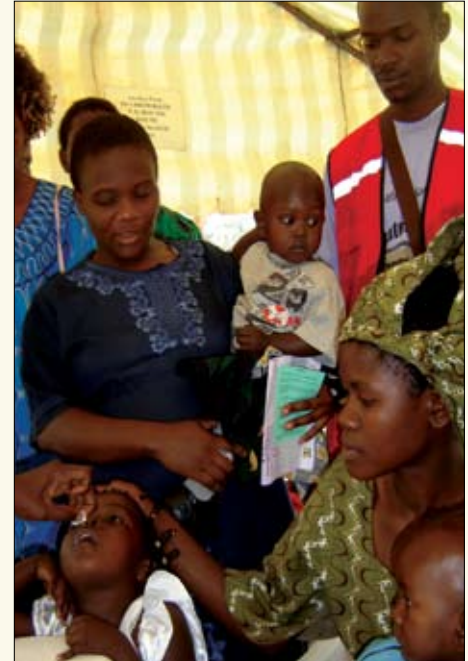
A Kenyan girl receives vitamin A drops during an integrated health campaign to help strengthen her resistance to disease.