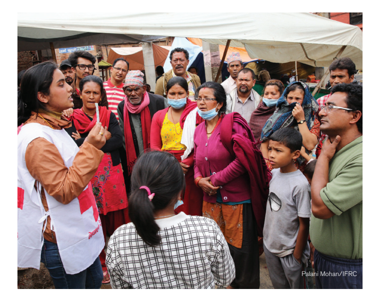
Nepal Red Cross volunteers distribute and train residents on using vital water purification tablets in Bhaktupur, Nepal.

The obstacles were daunting, with many survivors living in remote mountain villages cut off from the outside world by the earthquake. Nevertheless, the global Red Cross network has reached more than 620,000 people with lifesaving aid, providing cash grants and relief items to