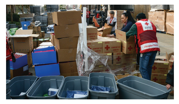
Red Cross volunteers work together in Yuba City, California, to produce wildfire relief kits for affected residents. The kits contain cleanup supplies like trash bags, gloves, rakes, shovels, and air filtration masks, essential hygiene items and more.

most to continue recovering. Funds can help families replace household items, offset transportation costs or support other recovery needs. Spending these funds locally will also support California communities as they continue recovering from the enormous economic losses inflicted by the wildfires.