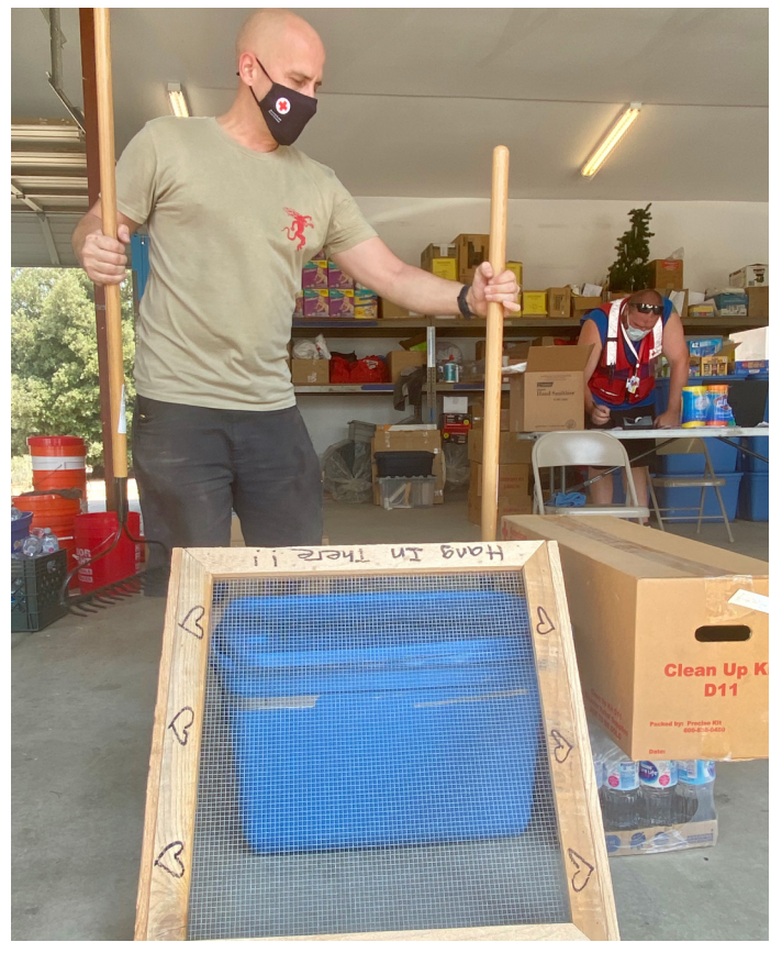
Red Cross workers assemble wildfire cleanup kits for distribution to residents impacted by the 2020 Lake Fire in Los Angeles County, California.

In addition to financial assistance and one-on-one support, the Red Cross is making plans to fund work carried out by partner organizations with specialized expertise to address unmet longer-term recovery needs