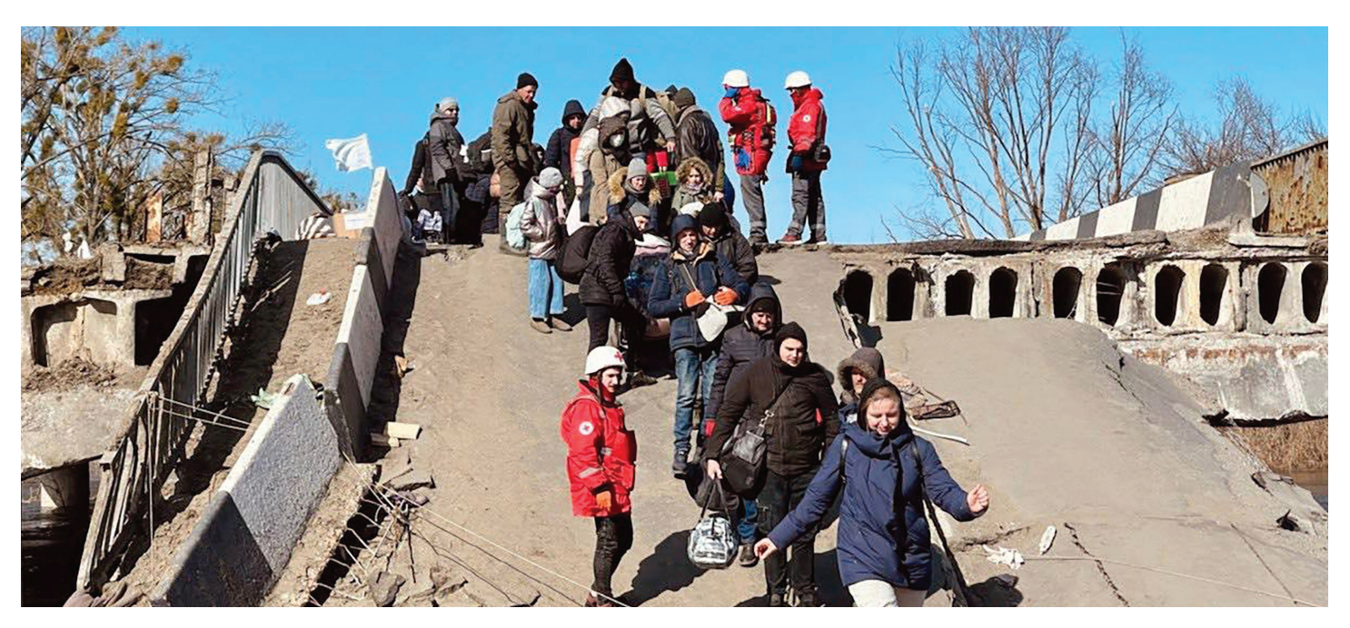
More than 15,000 people used a river crossing in Demydiv, Ukraine, built by Ukrainian Red Cross volunteers and local residents after the permanent bridge was destroyed early in the conflict. Volunteers evacuated thousands of people and hundreds of tons of humanitarian goods were transferred under fire using this improvised river bridge.

Finally, the ICRC, along with the Ukrainian Red Cross and several other national societies, has worked over the past year to help trace family members who have been separated from their loved ones and restore communication. The ICRC's central tracing agency (CTA) responds to these and thousands more requests for help each week. To date, the CTA has collected, followed up on and safeguarded information on 4,000 people, including prisoners of war (POWs) and their families.