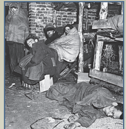
Polish Red Cross

Inspired in part by her work in the Civil War, Clara Barton would later found the American Red Cross and also advocate for the U.S. ratification of the first Geneva Convention.