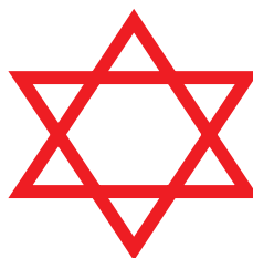
Red Shield of David