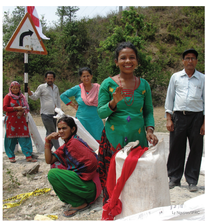
Families from Sindhuli with shelter toolkits provided by the American Red Cross. These toolkits will help residents construct temporary shelter until their homes can be rebuilt or repaired.

The American Red Cross responds to disasters around the world by mobilizing cash support, pre-positioning relief supplies, deploying disaster response experts and, in some cases, implementing recovery and preparedness programs. The remarkable generosity of our supporters individuals, corporations and foundations—drives our ability to provide relief and assist our partners in the global Red Cross network. We are grateful for your trust.