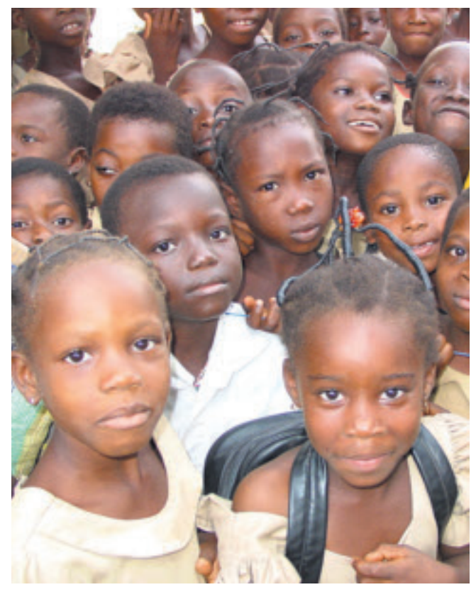
These Togolese children received measles vaccinations thanks in part to the Measles Initiative.

Last year, the American Red Cross was asked to respond to 21 international crises, contributing more than $8.4 million in financial aid, 13 delegates and more than 65,000 relief items such as tarps, blankets, toiletries and jerry cans for water. The American Red Cross helped the Movement assist an estimated 5 million people on six continents. To name only a few: We contributed supplies and relief workers to Ethiopia after severe floods, funding and disaster responders to the Philippines following typhoons there, monetary support for the purchase of relief supplies for displaced people in response to the humanitarian crisis in the Middle East and hygiene kits following volcanic eruptions in Ecuador. Our strategy ensures a rapid, targeted initial response and a long-term recovery approach that engrains resilience, all the while fostering community safety, resulting in more lives saved and a readiness to cope with the future. Our work minimizes long-term damage to local environments and offers sustenance to damaged economies as they reestablish themselves. People emerge, transformed by their experience, yet stronger.