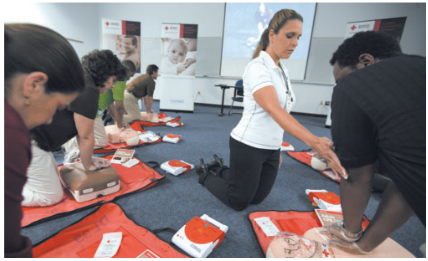
Millions of people were trained or recertified in first aid, CPR and the use of AEDs last year.

To date, we have spent nearly $2 billion of the $2.1 billion donated to help people with needs related to the 2005 hurricane season. We thank the American people for enabling us to continue our work in the Gulf Coast states. We have been able to provide such a diverse array of long-term assistance in the region only through your compassionate donations. Your unprecedented generosity has had a deep and sustained impact in this region.