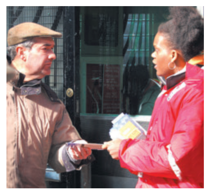
Around the country, the Red Cross spreads the preparedness message in multiple ways.

Expanding our outreach, we produced another quick reference guide to aid family caregivers this year. The guide includes a companion DVD to help those who care