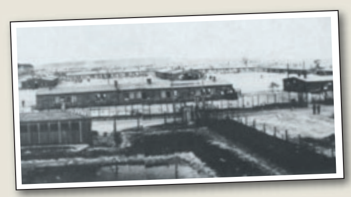
In this photo of the POW camp where Fred Rector was held, white patches on the windows of the barracks are pieces of cardboard taken from Red Cross parcels to replace broken glass.

The B-17 careened into a snap roll, pinning my crew to the walls of the aircraft. Then my co-pilot took some shrapnel to his arm. Our left engine went dead and half of our tail, including our stabilizer, was shot off. I pulled the plane out of its spin, but it resumed careening around before too long. With that much damage and with that strong a headwind, you don't stand much of a chance.