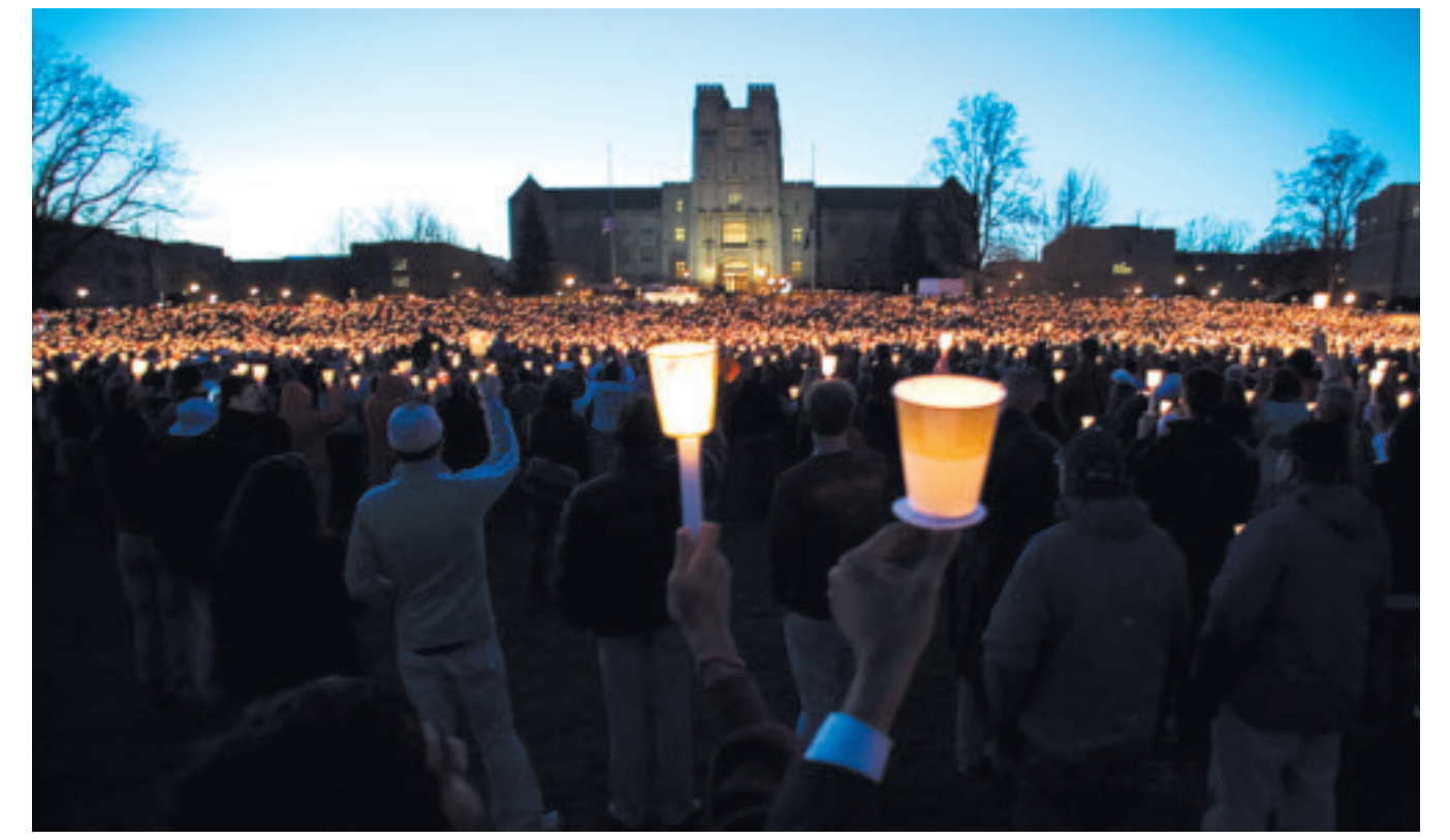
At Virginia Tech, the community joined for a candlelight vigil in memory of the students and teachers shot and killed in April 2007. Red Cross workers provided trauma and grief counseling as well as information and support for families.

It's tough enough to lose your home and all of your personal belongings. But just imagine how helpless you'd feel if you lost everything you owned and you had special needs. Perhaps a flood washed away your wheelchair, or a fire destroyed the customized bed that took you years to afford. To better respond to such situations, the Red Cross worked with the U.S. Department of Health and Human Services to create a new intake process and assessment tool, now used by both organizations to best accommodate survivors with special needs. In addition, we worked with national disability advocates to purchase equipment (accessible cots, commode chairs and shower stools) tailored for people with disabilities who find themselves in a shelter.