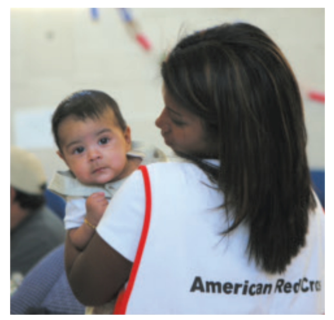
A walk around the shelter helps this baby fall asleep-and gives tired parents a rest.

The Red Cross will be there for you, with you, every day, in your neighborhood. The Red Cross emblem is so interwoven in our communities that seeing it is an almost everyday occurrence. Come join us. Because the American Red Cross and its work is everyday, practical and ordinary–but with extraordinary results.