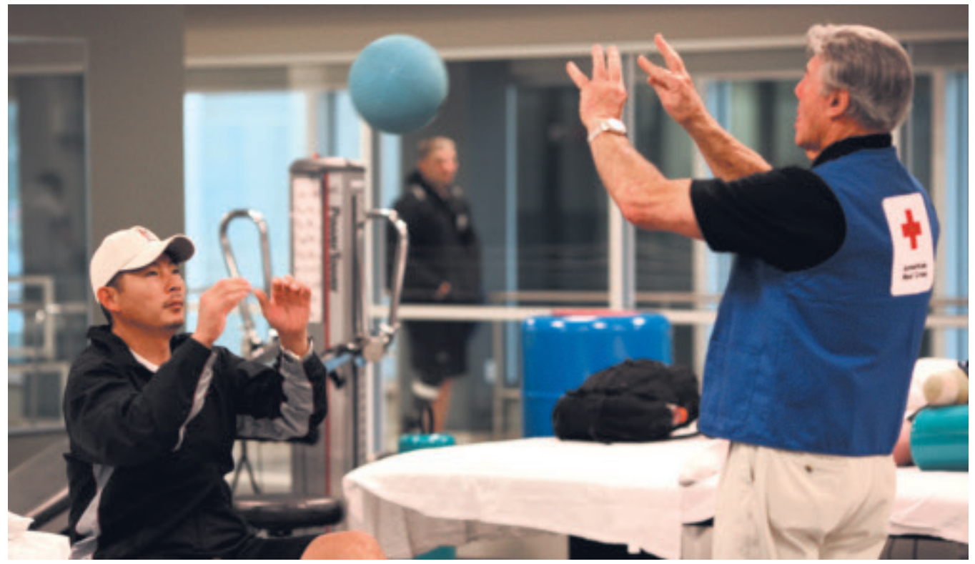
At Walter Reed Army Medical Center, a Red Cross volunteer tosses a ball around with a recovering service member, helping him rebuild stability.

More than 5,000 Red Cross volunteers, including youth volunteers, work in military hospitals and Veterans Administration hospitals and clinics. Volunteers assist injured service members as well as veterans, support families and help hospital caregivers.