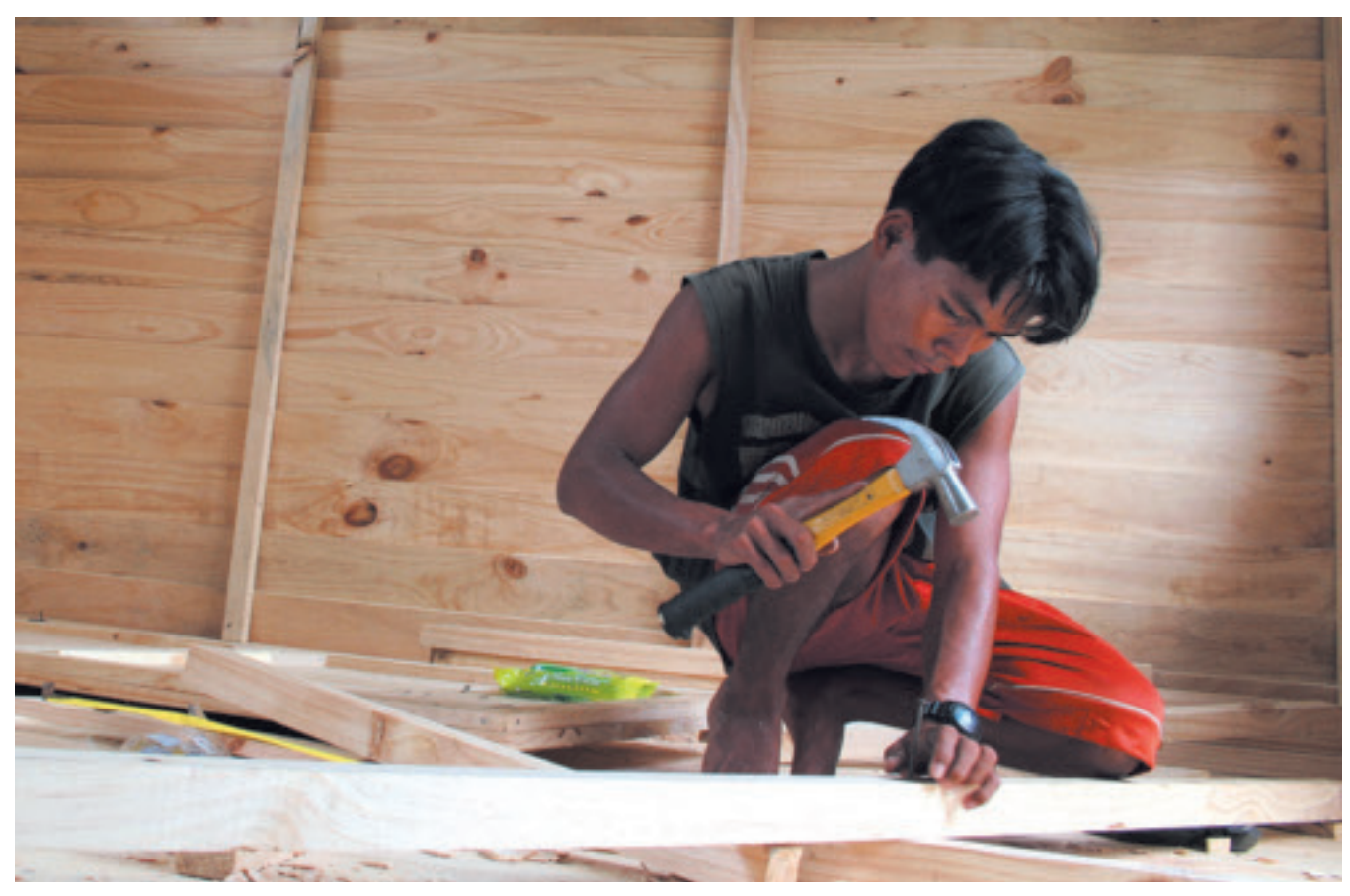
As part of the American Red Cross transitional shelter program, residents in Aceh, Indonesia, still rebuilding after the 2004 tsunami, do hands-on work in the assembly process.

Our Web-based database that connects people in need with providers of assistance is fast becoming a standard tool of disaster relief. As you read this, a caseworker is likely accessing the Coordinated Assistance Network (CAN) to find a relief agency to help someone in need. Working closely with the nation's other leading disaster relief organizations, the Red Cross created a single point of entry to enable caseworkers nationwide to speed service delivery and reduce paperwork, while ensuring that disaster survivors would have to describe the troubling details of a disaster only one time. Caseworkers from more than 260 nongovernmental agencies need only to log onto the secure system to update or review client information and match it with an appropriate relief provider.