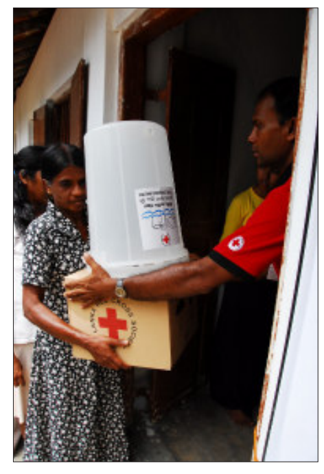
A Sri Lankan woman receives a ceramic water filter kit from a Red Cross worker.

In all American Red Cross water and sanitation programs, beneficiary participation is a crucial component. Involving community members in the planning, design and maintenance of programs helps ensure that the new sanitation facilities and drainage systems for schools and homes are appropriate and will be well maintained. Through holding regular meetings, trainings and follow-up visits, the American Red Cross is encouraging and empowering communities to commit to taking care of and maintaining their new water and sanitation systems.