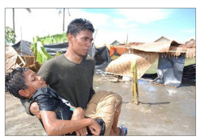
A community volunteer carries a boy during a disaster simulation activity.

Local Red Cross staff members have been trained in the Community-Based Disaster Risk Reduction program (CBDRR) which gives communities the knowledge, skills and equipment they need to reduce risk and mitigate the impact of future disasters. The American Red Cross works with local staff members, who train local leaders and volunteers to form rapid response teams, create disaster plans and conduct regular drills.