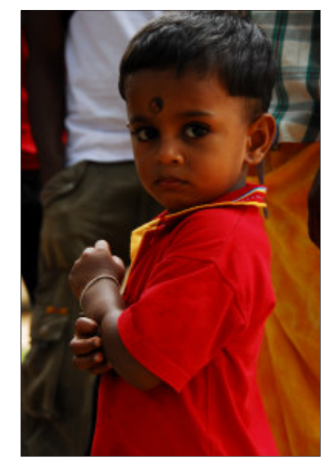
A Sri Lankan boy curiously watches a ceramic water filter presentation.

As reconstruction efforts continue and families seek to re-establish livelihoods, the American Red Cross is supplementing the nutrition of vulnerable mothers and children. With funding from the American Red Cross, the UN World Food Programme (WFP) and local Red Cross staff are implementing school-based nutrition programs for