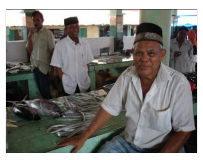
Indonesian men sell fish in a healthy market funded by the American Red Cross.

Many of these projects have had to wait until roads have been rehabilitated and reconstructed to allow for construction and trade opportunities. Early in the recovery process, the American Red Cross supported