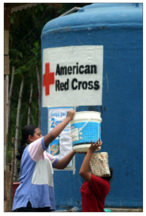
Two Indonesian women get clean water from a water storage tank provided by the American Red Cross.