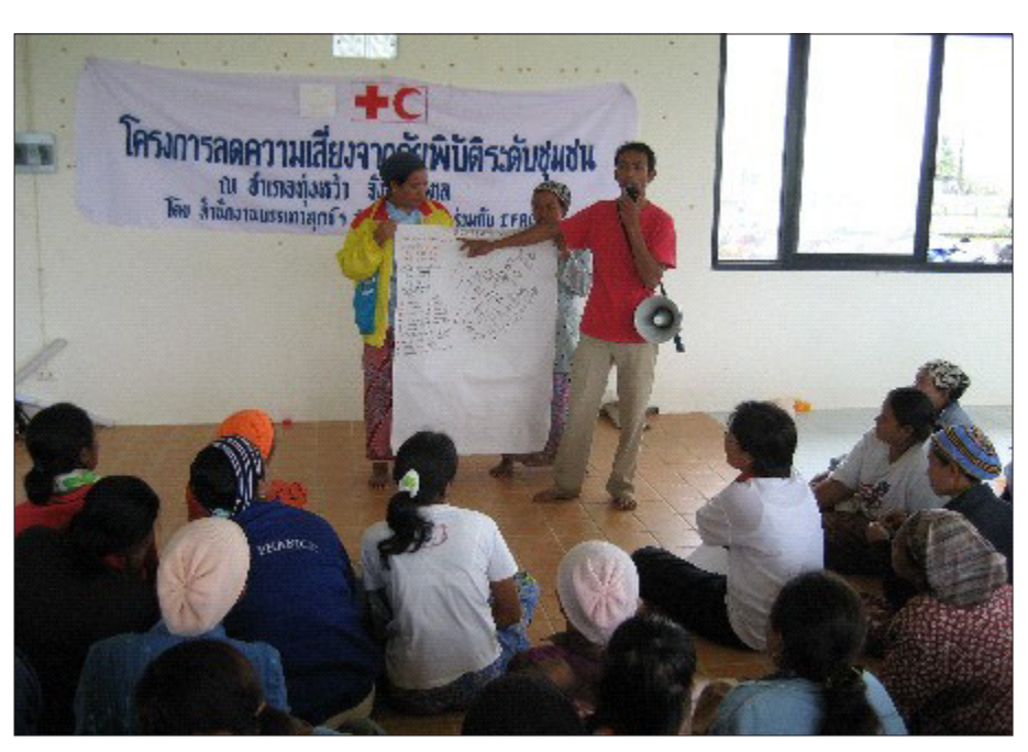
A Thai Red Cross staff member leads a community disaster assessment activity in Baan Rawai Nue, Thailand.

By equipping local Red Cross chapters and communities with radio networks, and teaching local rapid response teams to use and maintain them, the American Red Cross is supporting early warning systems in vulnerable communities. Last year, the American Red Cross worked in Indonesia, Sri Lanka and Thailand with local Red Cross members and communities to strengthen and expand early warning systems. The goal of these programs is to link these community-level systems into regional and national level systems that will ensure communities and local Red Cross members are able to communicate prior to, during and after the onset of a disaster.