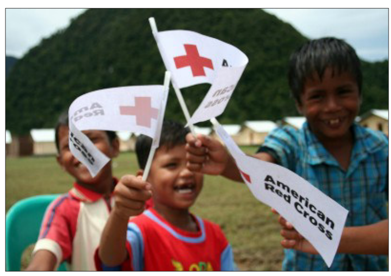
Indonesian children wave American Red Cross flags.

Despite these challenges, the American Red Cross strives to reach those in need, regardless of political affiliation, ethnicity, language or religion. The work of the American Red Cross upholds the seven principles— humanity, impartiality, neutrality, independence, voluntary service, unity and universality— that guide the work of the Red Cross and Red Crescent Movement.