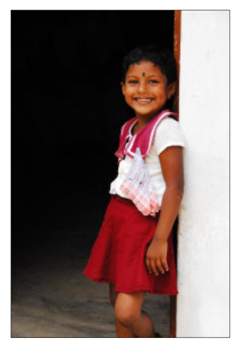
A Sri Lankan girl smiles as she watches a ceramic water filter presentation.