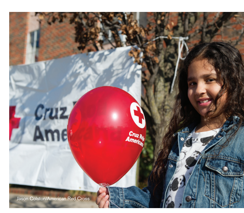
The Red Cross highlighted its Spanish-language outreach—la Cruz Roja—at a March event in Oklahoma City. After the May tornadoes and their impact on the Hispanic community, the Red Cross recognized an urgent need to better prepare Hispanic families.

Dozens of Red Cross volunteers provided oneon-one briefings and distributed preparedness kits from Helping Oklahomans Manage Emergencies (HOME). The HOME kits include weather radios, smoke and carbon monoxide detectors, a Red Cross whistle, flashlight and educational literature about what to do if a disaster strikes. These preparedness kits and community meetings help ensure that people not only have essential items to make them better prepared, but also have the know-how to use the kits effectively.