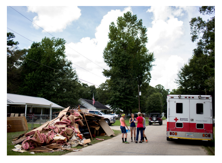
Across southern Louisiana, the Red Cross is helping thousands of people who are starting the long cleanup process.

Estimates show our relief effort could cost $25 million to $30 million. As of Sept. 13, we've received nearly $23