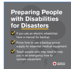
Red Cross Prep Preparing People with Disabilities (also provided as Vertical size)