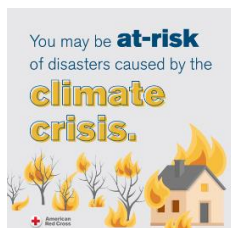
Climate Crisis Disasters (Also provided as vertical size)

Click here to download graphics/photo below.