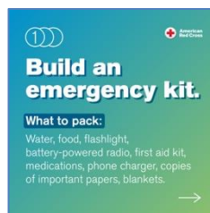
Red Cross Prep Emergency Plan 2