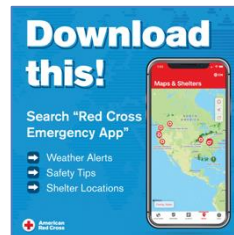
Red Cross Prep Emergency App (also provided as Vertical size)