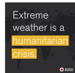
Red Cross Climate Crisis