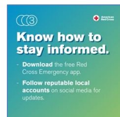
Red Cross Prep Emergency Plan 4