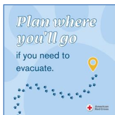
Red Cross Prep Plan with Pets