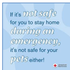
Red Cross Prep Pet Safety