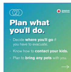
Red Cross Prep Emergency Plan 3