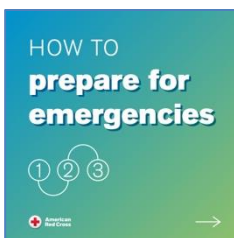
Red Cross Prep Emergency Plan 1