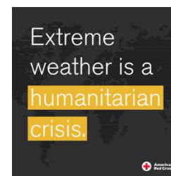
Red Cross Climate Crisis