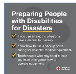
Red Cross Prep Preparing People with Disabilities (also provided as Vertical size)