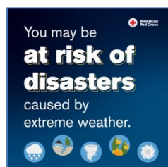
Extreme Weather (Also provided as Vertical size)