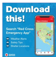
Red Cross Prep Emergency App (also provided as Vertical size)