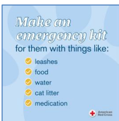
Red Cross Prep Kit for Pets