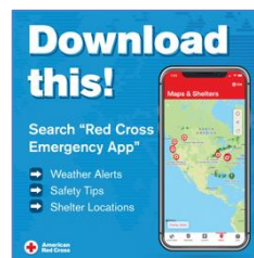
Red Cross Prep Emergency App (also provided as Vertical size)