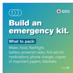
Red Cross Prep Emergency Plan 2