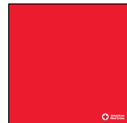
Working Smoke Alarms

Our disaster relief partner, the @RedCross, responds to more than 65,000 disasters each year – the majority of which are home fires. Working smoke alarms help save lives, and if your smoke alarms are more than 10 years old, it's time to replace them. Learn more about these lifesaving devices: redcross.org/fire