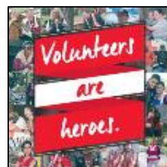
Volunteers Are Heroes