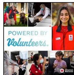
Powered by Volunteers

Did you know volunteers are the backbone of our disaster relief partner, the @RedCross? 90% of their workforce is volunteer. If you're interested in making a difference with the Red Cross, visit redcross.org/VolunteerToday .