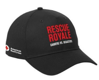
Raise $200 = Rescue Royale Hat

In appreciation for your fundraising efforts, you can earn these items. *