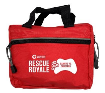
Raise $750 = Red Cross Disaster Kit