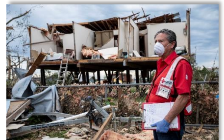
The American Red Cross does damage assessment from a tornado in Onalaska, TX. A powerful tornado damaged hundreds of homes in the community earlier in April 2020.

RESOURCES: Quick Start Tiltify Toolkit | Rescue Royale Tournament Sign Up | Streamlabs OBS Theme CrowdControl Guide | Setup | Red Cross Disaster Relief | Compatible Games - CrowdControl