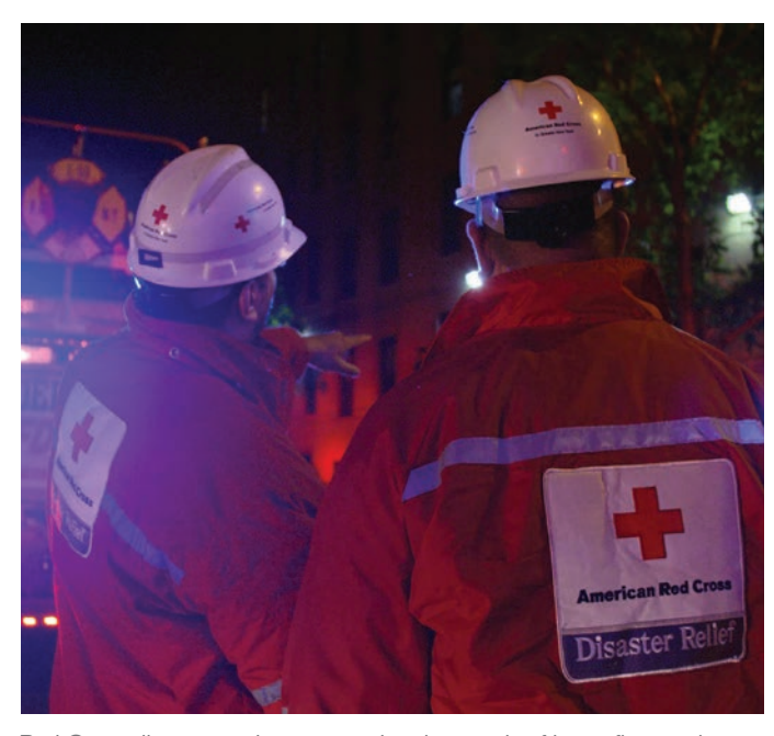
Red Cross disaster workers respond to thousands of home fires each year, like this May 2017 fire in New York City.

These large-scale disasters made up only a fraction of our disaster responses. Local Red Cross chapters were also at work in communities in every state across the country each day, responding to thousands of crises that, while not making national headlines, were lifechanging events for those impacted. With your help, the Red Cross brought relief and comfort to countless people affected by these and other everyday disasters in fiscal year 2017, including more than 55,000 home fires.