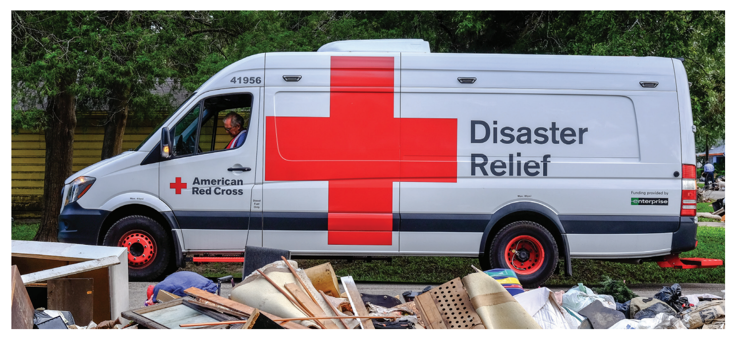
A Red Cross emergency response vehicle brings food and other relief support to a flood-damaged neighborhood in Wharton, Texas, as residents cleaned up from Hurricane Harvey.

While we will continue to accept donations designated to Hurricane Harvey, the Red Cross has ceased active fundraising for Hurricane Harvey, and has removed the Hurricane Harvey donation option from all fundraising channels. People who wish to support Harvey relief efforts—or any specific cause—can always do so by using the downloadable donation form on redcross.org.