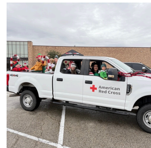
The "Elf Reinforcements" prepare to join the parade

Volunteers from the Heart of Texas Chapter brought holiday magic to the College Station Christmas Parade with their festive float, "Elf Reinforcements." Their joyful spirit helped light up the season and connect with the community in a fun and meaningful way.