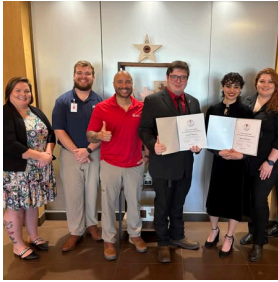
Honorees receive the Red Cross Life-Saving award