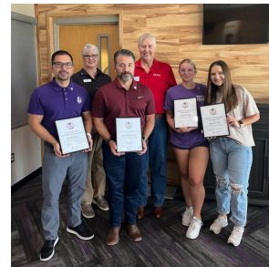
University of Mary Hardin-Baylor students and staff accept award

Students and staff at the University of Mary Hardin-Baylor were recognized with the Red Cross Lifesaving Award for saving a peer who collapsed while lifting weights. Their swift response and teamwork made all the difference in a life-threatening moment.