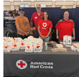
Volunteers provide hygiene kits to homeless veterans

Heart of Texas volunteers joined Operation Stand Down to support homeless veterans with hygiene kits and essential resources. The event offered meals, medical screenings, and clothing—bringing dignity and care to those who've served. We're proud to stand beside our veterans and help meet their needs with compassion.