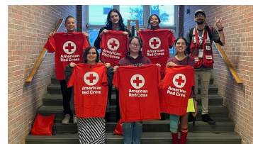
The Big Spring High School Red Cross Club at their holiday party

We also held three resiliency workshops at the VA Hospital, helping veterans and their families build skills to face difficulties with confidence.