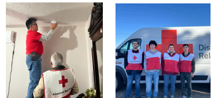
West Odessa Sound the Alarm event

In West Odessa, the Sound the Alarm campaign brought together local community organizations in a powerful show of unity. Volunteers rallied to install smoke alarms and educate residents on fire safety. This initiative also sparked the formation of a COAD (Community Organizations Active in Disasters), laying the groundwork for a more coordinated and effective disaster response network.