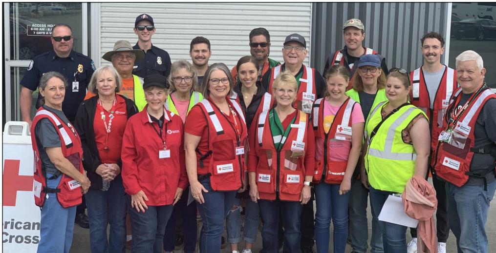
Red Cross volunteers and community partners teamed up to install free smoke alarms and share information in Idaho Falls.