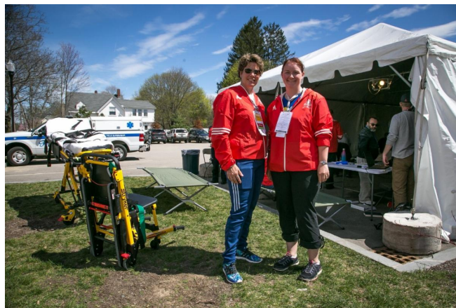
Red Crossers provide Marathon runners medical services.