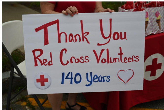
Red Cross volunteers appreciated at recent event