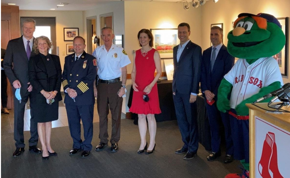
Attending the Day of Remembrance Blood Drive at Fenway Park, left to right: