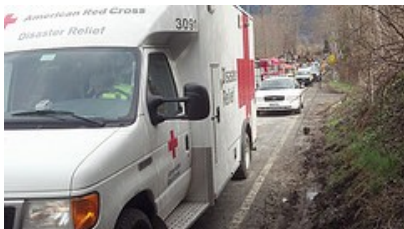
Red Cross providing canteen service for emergency teams