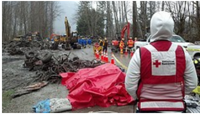
Volunteer viewing mudslide area