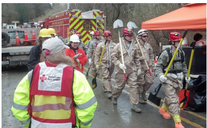
Search and Rescue personnel marches to the disaster area