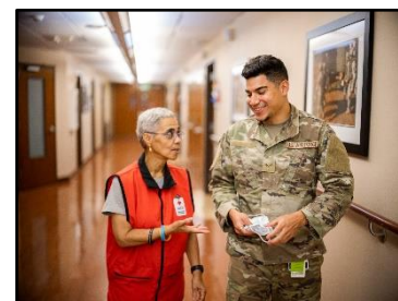
Red Cross volunteer speaks with a service member