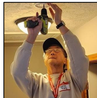
Smoke Alarm installation Bloomington