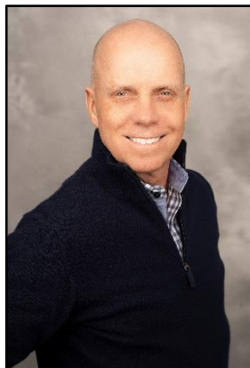
Scott Hamilton, Featured Star