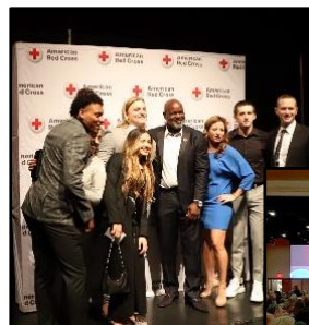
VIP Reception – photo opportunity with Featured Star