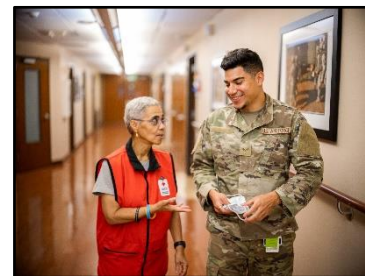
Red Cross volunteer speaks with a service member