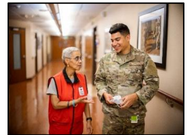
Red Cross volunteer speaks with a service member