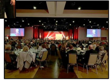
Dinner & Program