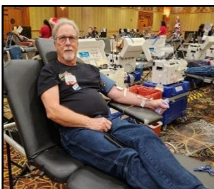
20 th Annual Peoria 12 Hours of Giving