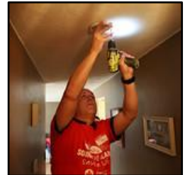
Smoke Alarm Installation Peoria