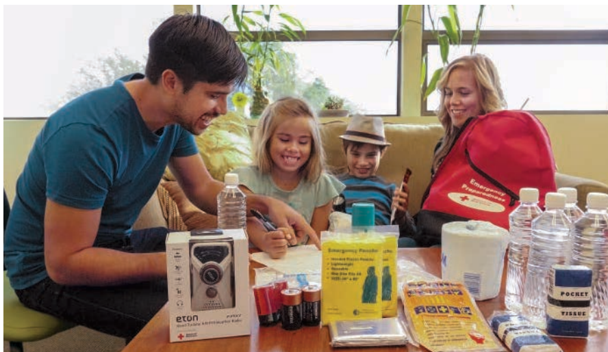
People need to be safe and prepared when disaster strikes.

Here are some tips to help better develop a disaster plan that will keep you, your friends, and family safe: