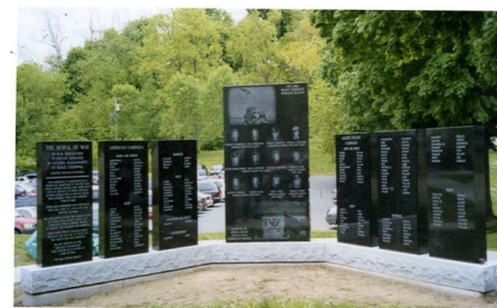
Cayuga County, New York World War II Veterans Memorial Dedicated Memorial Day, May 30th, 2005

Download the app to navigate the parks on the go.