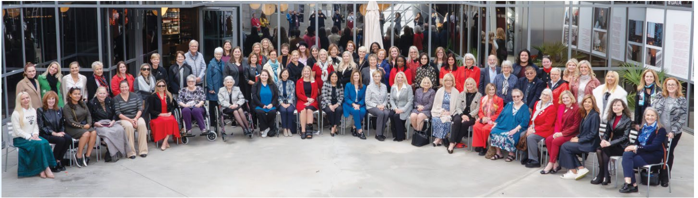
American Red Cross Tiffany Circle members and staff toured the International Red Cross and Red Crescent Museum in Geneva

In October, over 140 Tiffany Circle members and friends representing 20 countries around the globe gathered in Geneva for the International Council Forum: A Journey of Humanity . Attendees were inspired by the outstanding humanitarian work of the International Committee of the Red Cross (ICRC) and the International Federation of the Red Cross and Red Crescent Societies (IFRC).