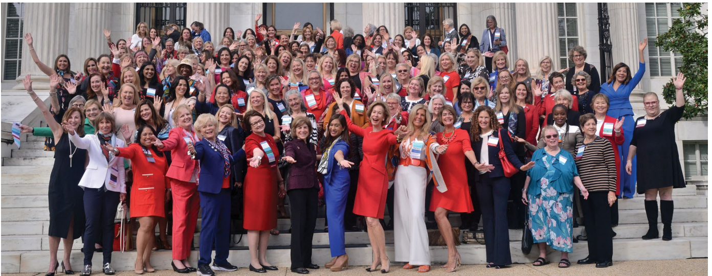
Members of the Tiffany Circle gather at the 2023 Summit in Washington, D.C.