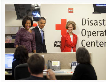
Former President of the United States, Barack Obama, and Former First Lady Michelle Obama tour the American Red Cross Disaster Operation Center in Washington, D.C., following a major earthquake in Haiti.

Led donor engagement trip to Haiti following 7.0 magnitude earthquake.