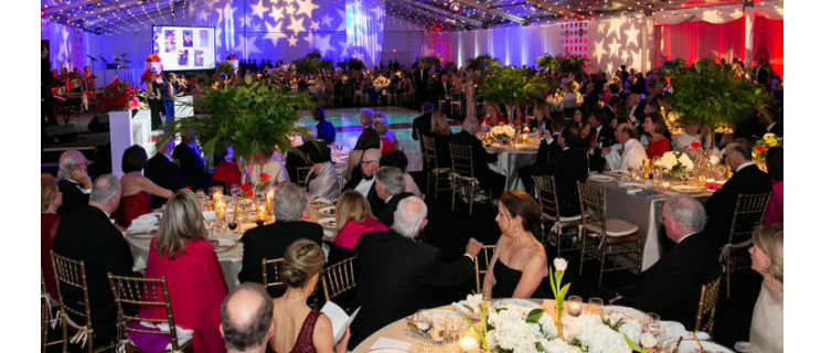
International Red Cross Ball, Norton Museum of Art, West Palm Beach, Florida, 2019

The 62<sup>nd</sup> International Red Cross Ball will make its highly anticipated return as the premier event of the Palm Beach social season on March 18, 2023, at The Breakers Palm Beach. The Ball will celebrate the organization's lifesaving work down the street, across the country and around the world, while proudly