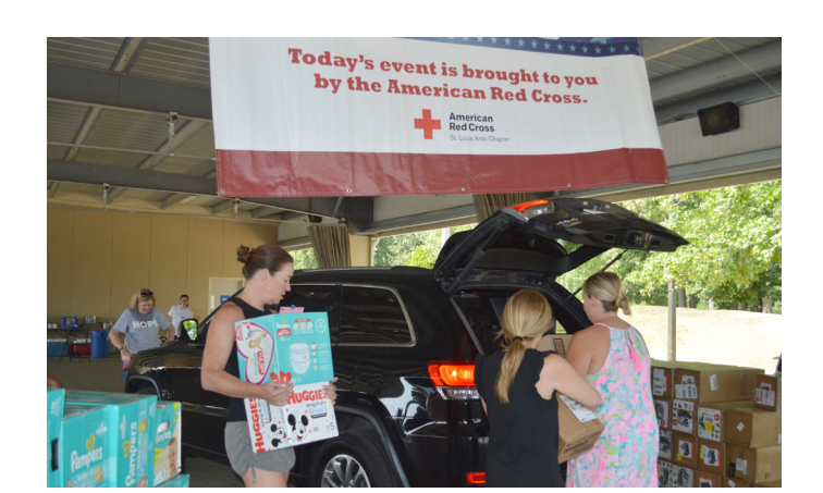
Red Cross volunteers load baby shower supplies into a service member's car.

The St. Louis Chapter of the Red Cross hosted its 8th Women Warriors Baby Shower on July 24 for enlisted and veteran women who are expecting or have new babies. On the day of the drive-