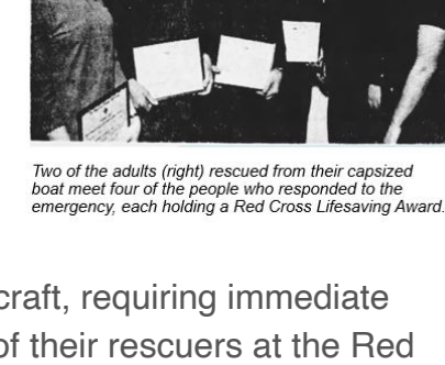
Cross Lifesaving Award ceremony, they thanked their heroes for the "miracle" of their two daughters' lives, both of whom have fully recovered.

When a boat carrying eight people capsized on the Missouri River, five