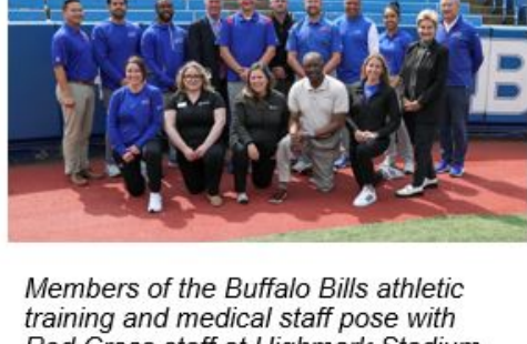
Members of the Buffalo Bills athletic training and medical staff pose with Red Cross staff at Highmark Stadium.