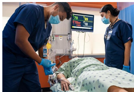
The courses are for non-anesthesia healthcare professionals who administer conscious sedation.